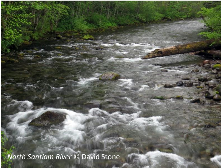
North Santiam River